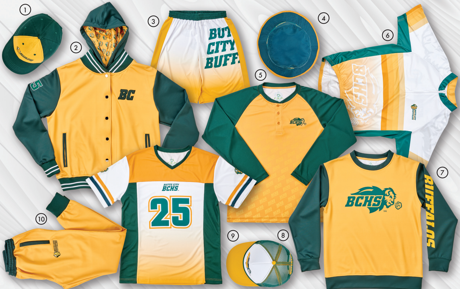
1.) 172QD 2.) FSP5107H 3.) FSP3100 4.) Bucket Hat 5.) FSP2005 6.) FSP2010 7.) FSP2500 8.) 102QD 9.) FSP2006 10.) CustomSweatpants

FOR MORE INFORMATION CONTACT YOUR ACCOUNT MANAGER TODAY